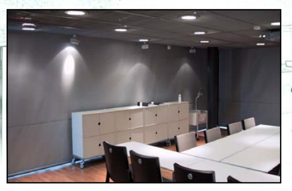
WideGlide 100 closed