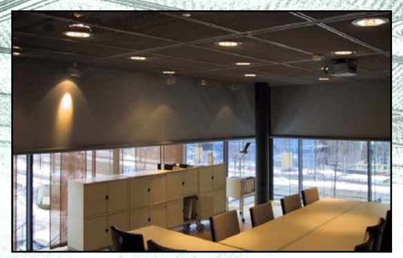
WideGlide 100 open