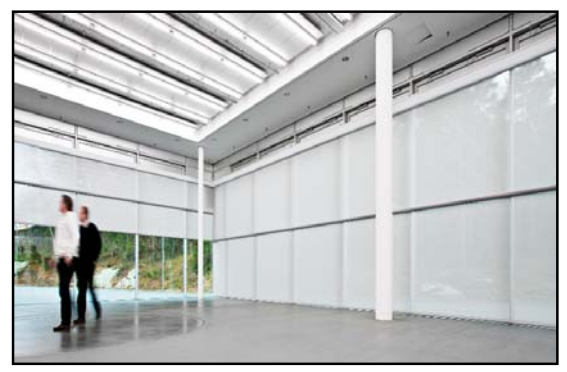
WideGlide 200 closed